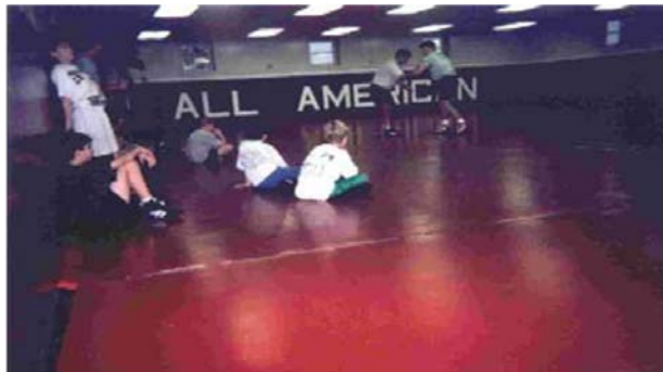
All American Training Center

**IMPORTANT NOTE: This list is not complete. Please revisit this site as a more comprehensive list will be made available.